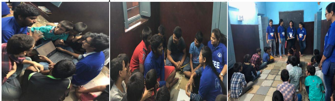
Volunteers explaining MS Office to children.

Some of the applications like MS Word, MS Power Point, MS Excel etc., which are basic and are used in any field and became a basic necessity for the students. Hence our volunteers took a small session to explain the children about the importance and the basics of MS Office.