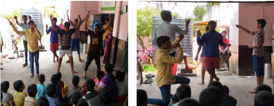
Children performing dance.

Later on, the children danced and expressed their joy.