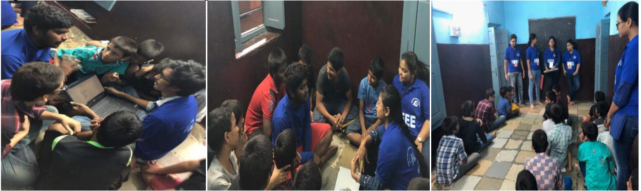
Volunteers explaining MS Office to children.

Some of the applications like MS Word, MS Power Point, MS Excel etc., which are basic and are used in any field and became a basic necessity for the students. Hence our volunteers took a small session to explain the children about the importance and the basics of MS Office.