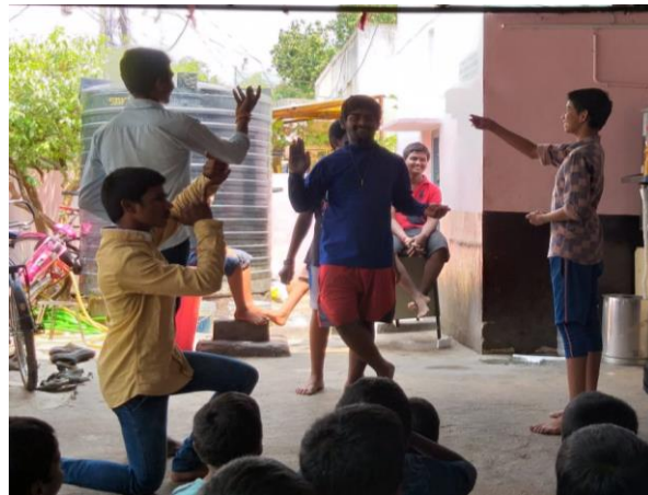
Children performing dance.

We distributed stationery and sweets to the children.