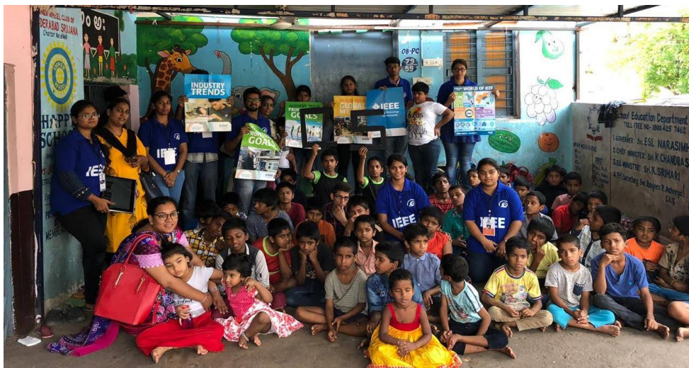
A group picture of group with children.

We distributed stationery and sweets to the children.